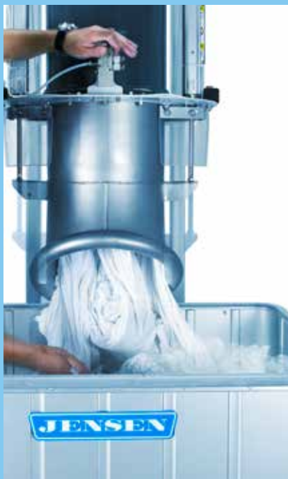
Ergonomic operation thanks to telescopic nozzle of stainless steel (option)