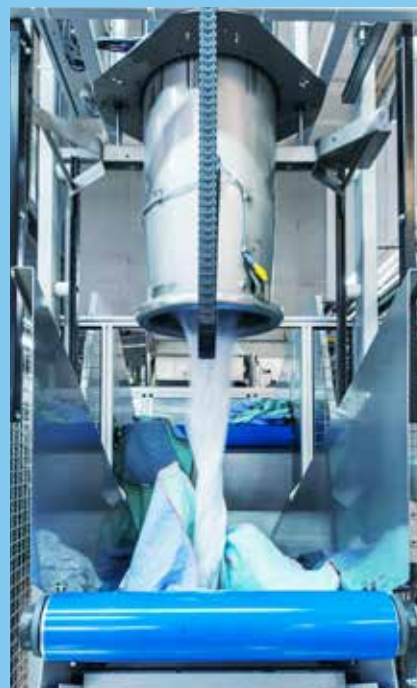
A Automatic loading behind a centrifuge 1. Unloading the centrifuge 2. Linen fed in to the fully automatic telescopic nozzle